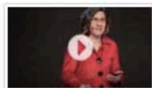
Lorrie Faith Cranor: What's wrong with your pa$$w0rd?