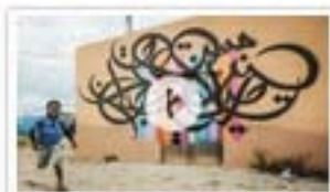
eL Seed: Street art with a message of hope and peace