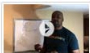
Intro to Serverless Computing