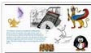
Fooled by Randomness - Nassim Taleb (Animated)